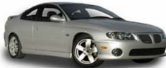
A Tradition of Performance