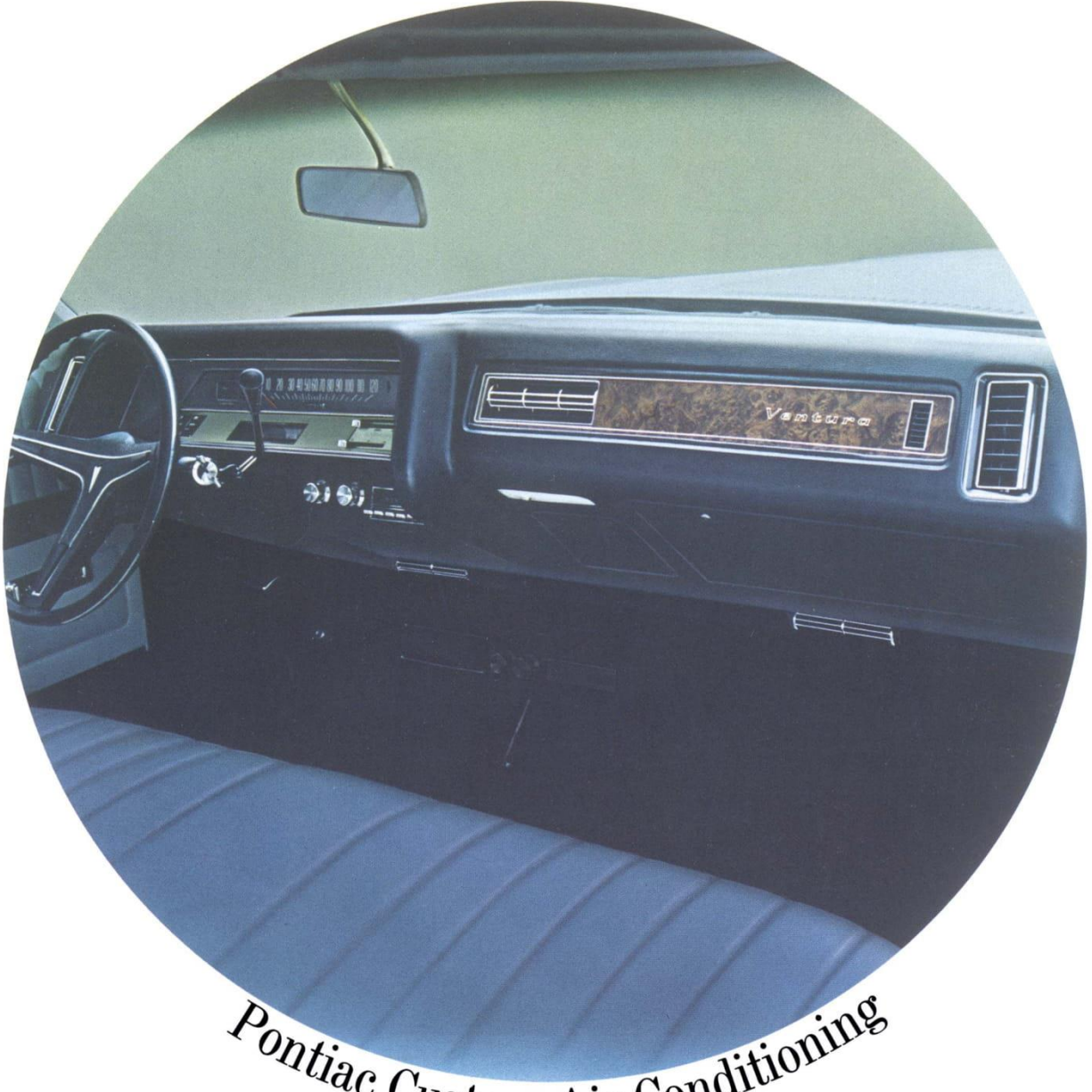
Pontiac Custom Air Conditioning