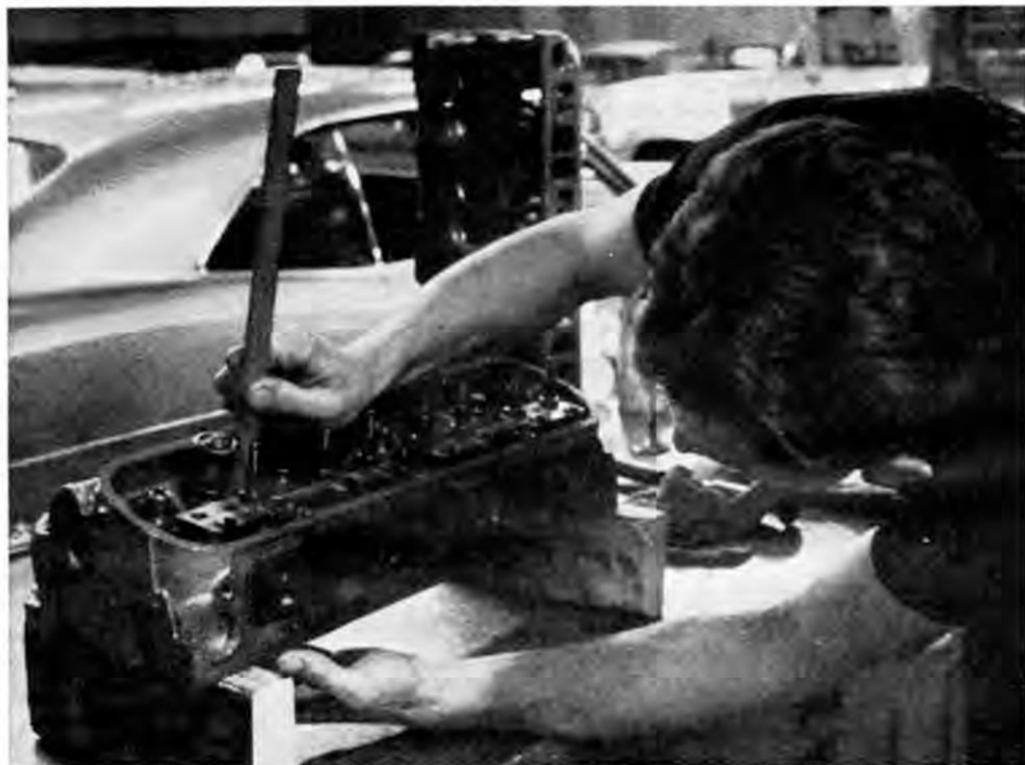
During the Bobcat phase of the testing program, the heads on the GTO came in for extra special attention in order to gain the additional engine speed necessary for shifts in the 6000 rpm range. Special sleeved lock nuts were installed as part of the Bobcat package, guaranteeing positive lash adjustment for thousands of street miles. A big gain in engine speed was realized by careful adjustment of the ball-joint rockers as outlined in the text in step-by-step style.

pushing a more comprehensive cylinder head job for buyers who want just a little more. Milt feels the extra compression that is available—which is legal under stock rules—is important in overall street and strip performance. The job includes a careful CC'ing of the combustion chambers to bring the volume down from the usual 69-70 cc on factory heads to the minimum legal 65 cc. A mill cut of .007 will remove one CC, so most heads will take about a .028 mill to attain the 65 cc. Then, Milt goes ahead and does a good valve seating job (though not a razor-sharp job on street engines since it won't last) and the job is topped off by shim-