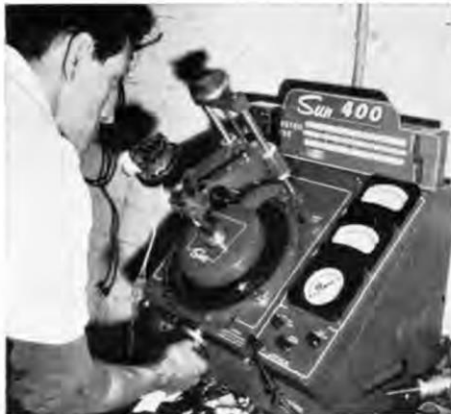
LEFT —The distributor is another important item on the Bobcat check list. Lighter springs and a revamped advance curve results in a total spark advance of 42 degrees above the 2600 rpm level.