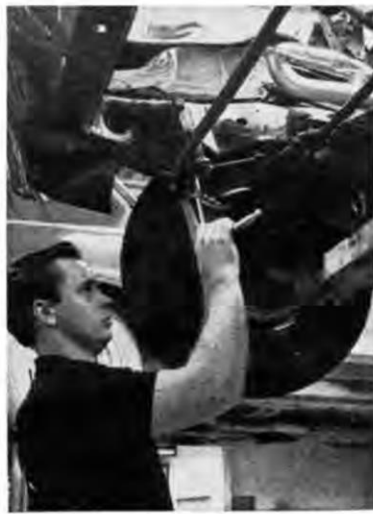
Extensive work was done to the front end on the blueprinted car, including installation of 90/10 Cure-Ride shocks for initial front end lift on hard runs.