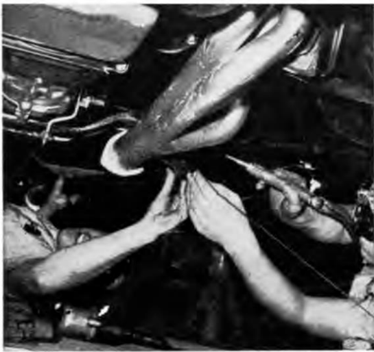
Bolting on a set of performance tuned headers is just like adding a few more horses. The white car came in for special attention with a set of Hurst experimental four-tube headers for maximum engine performance.