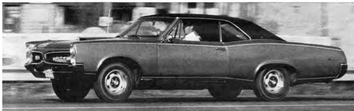
ABOVE —With Dave Warren driving, the showroom stock "blue" GTO turned steady times of low 14's at 100 mph. When the tires were changed to M&H slicks, times dropped into the high 13-second bracket.