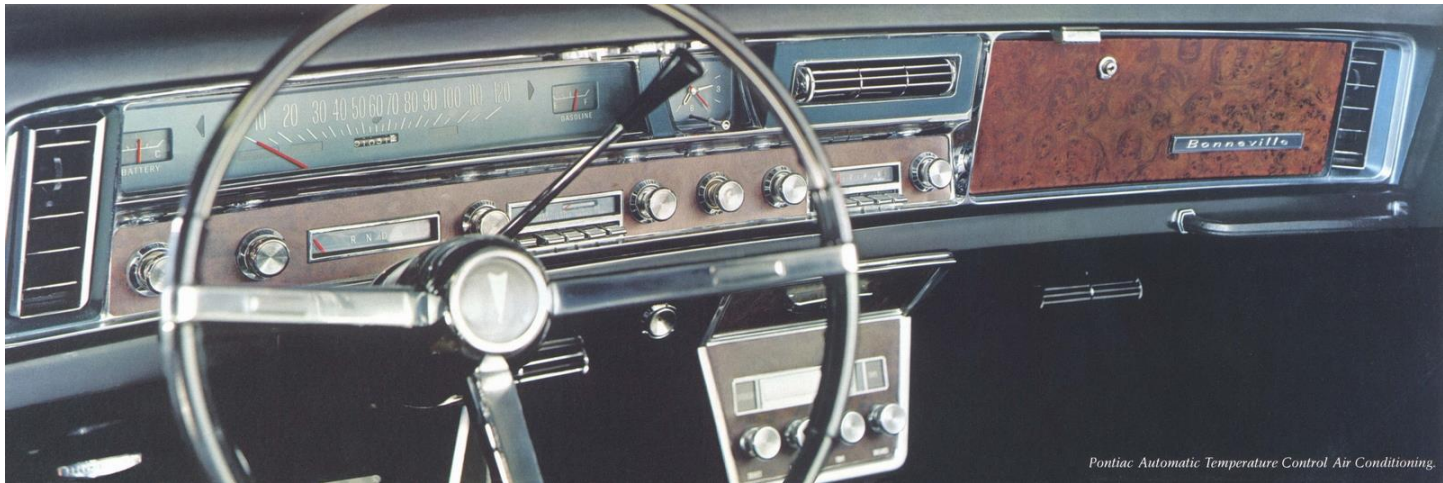
Pontiac Automatic Temperature Control Air Conditioning.